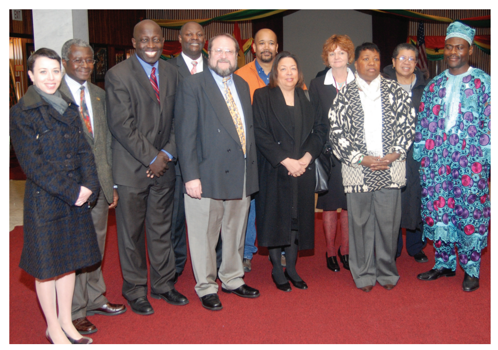
School Teachers, Let's Go Africa Foundation and Rio Tinto Staff

programs. Sandviks efforts in Human Resource and Education in Africa were highly noted.